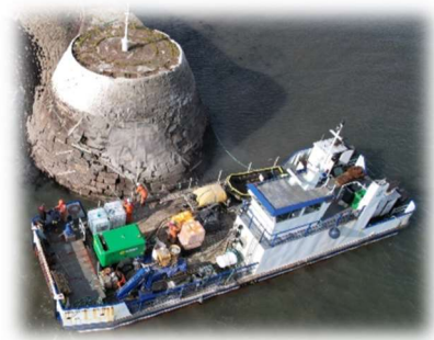
Arbroath Harbour Maintenance