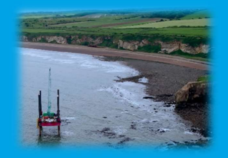
The project was delivered within the tidal zone from a 250 Tonne Jack Up barge.

Operating from a Jack Up Barge positioned off the coast of County Durham, Southbay successfully refurbished 2no. short sea outfall structures on behalf of the Coal Authority, which form part of the Dawdon Mine Water Treatment Scheme. Working with a team of divers, specialist sections damaged outfall were removed allowing hydro demolition of the sea bed. Grout bags were then installed as a foundation upon which precast concrete units were installed to form new sections of outfall. All existing pipework was then reconnected. Due to the challenging weather conditions, the project was delivered in two distinct phases, with the site team demobilising over the winter period. The mine water treatment scheme treats over 2 billion litres of water every year, and is used to protect the public from the UK's coal mining legacy.