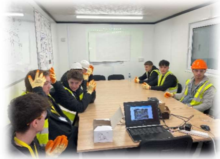
Students from the college were invited to visit our Tyne Clean Energy Park Marine Works site within the Port of Tyne.