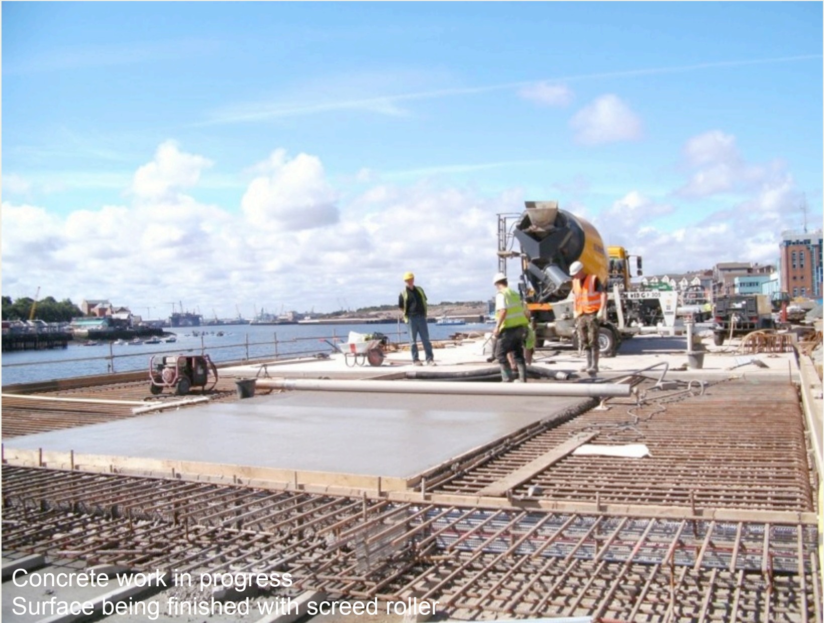
Concrete work in progress Surface being finished with screed roller