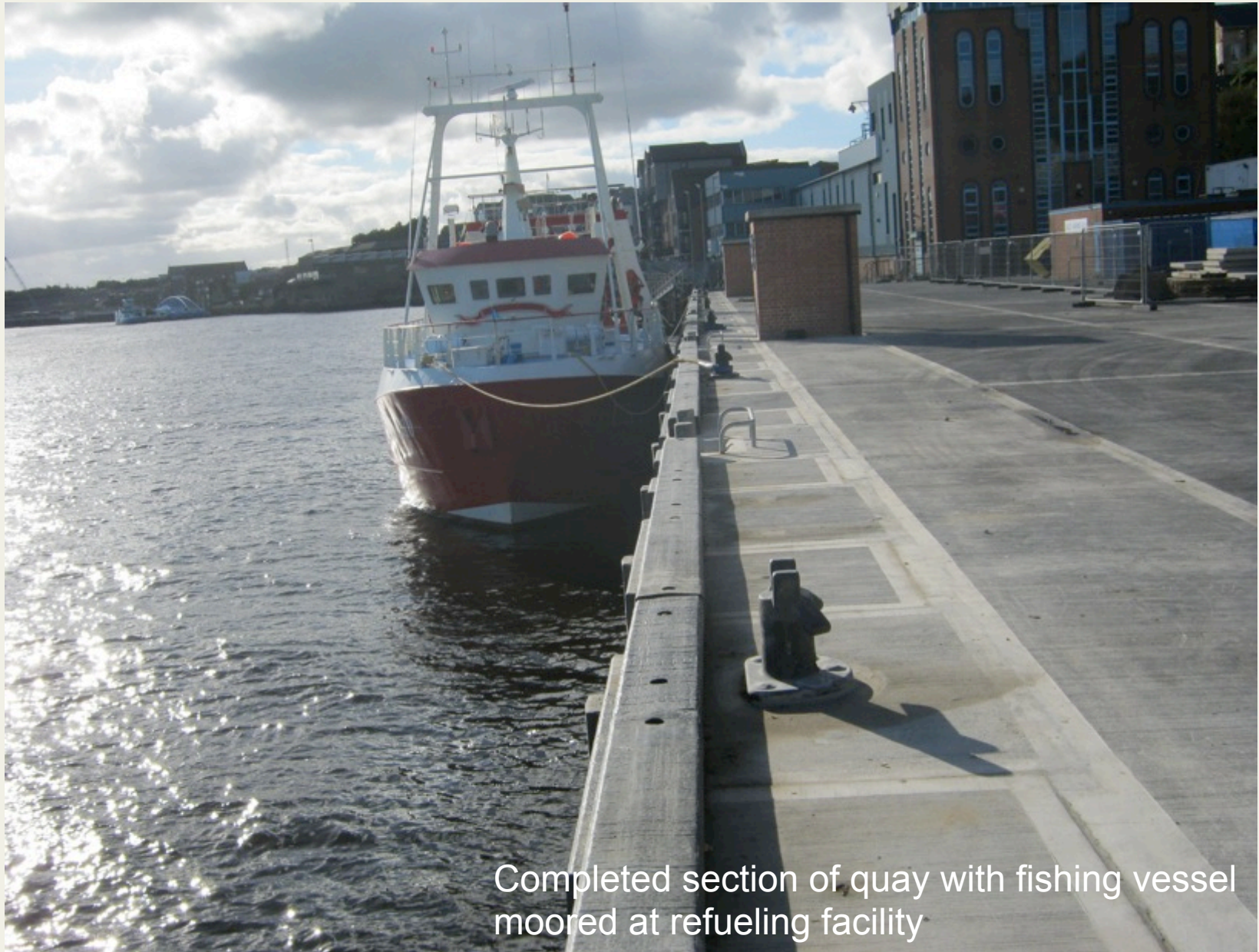
Completed section of quay with fishing vessel moored at refueling facility