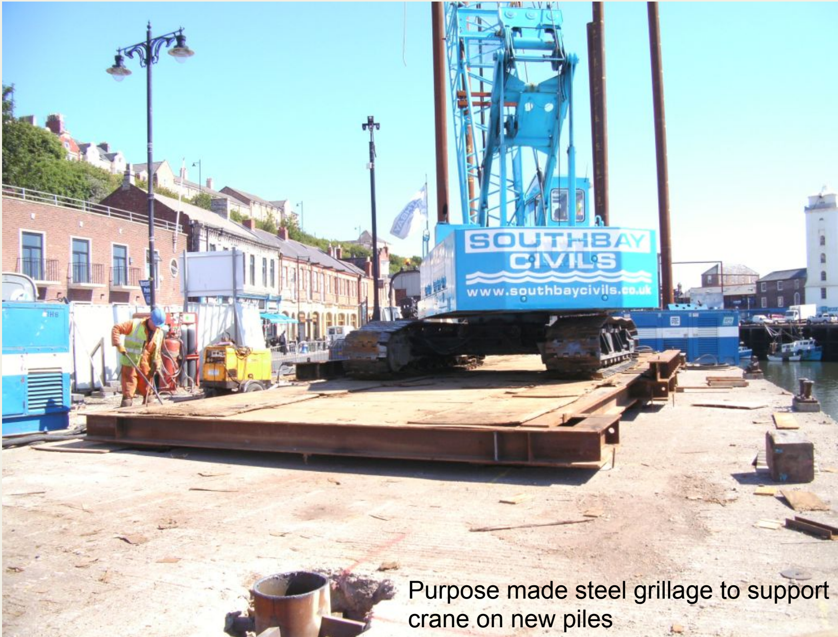
Purpose made steel grillage to support crane on new piles