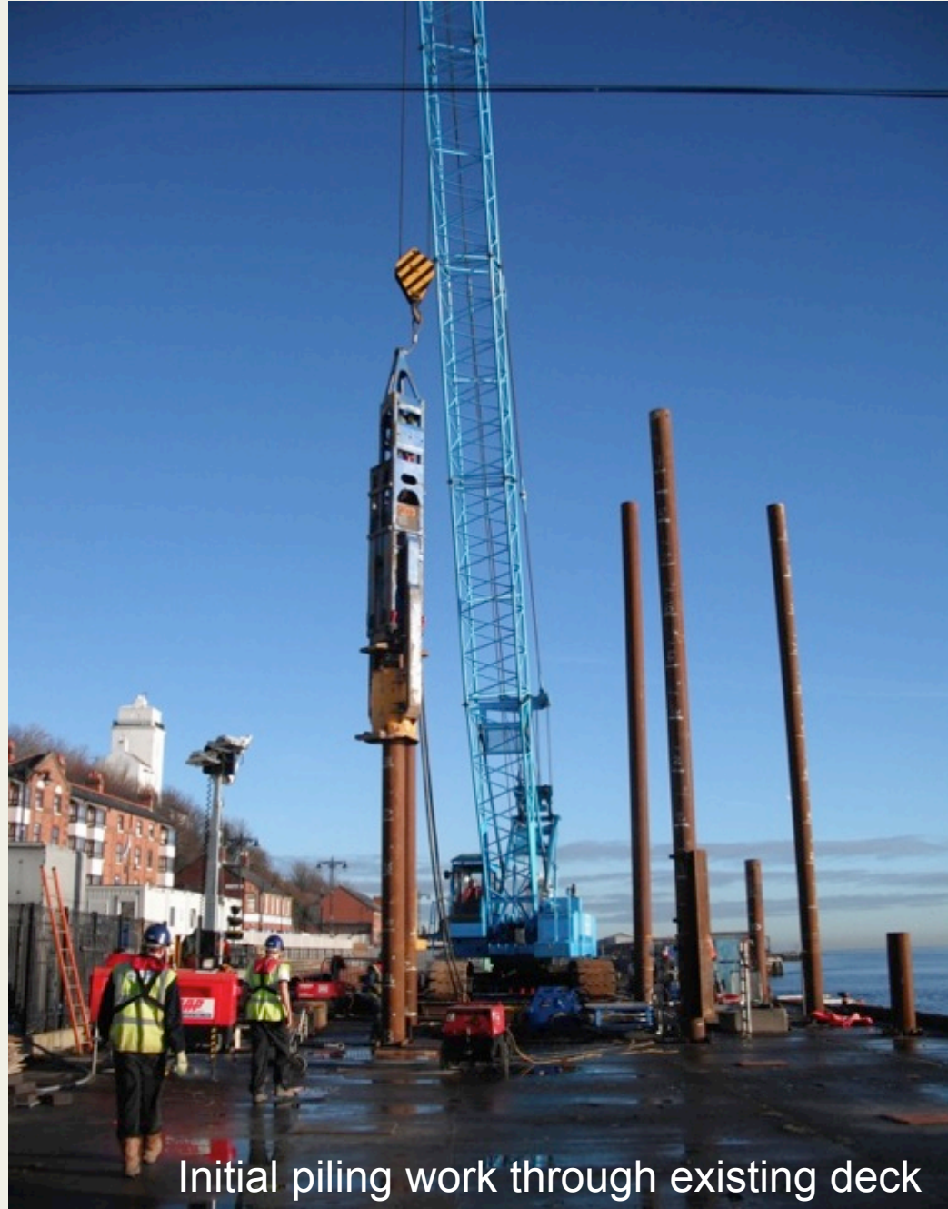
Initial piling work through existing deck