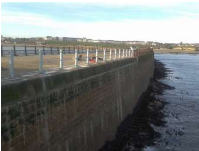
Copings pointed using Easipoint Marine Mortar

The works had to be completed during a 4-week closure of the pier to the public. The works were complete on time and to budget.