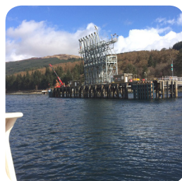
Loch Striven Fender Repair