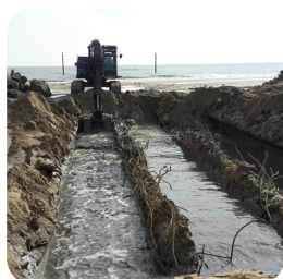
Blyth Groyne Cover