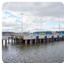
Riverside Quay Extension